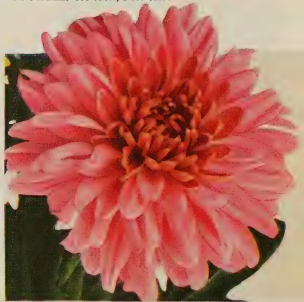
BETTY. 50c each; 3 for $1.25

6 Supreme MUMS All high-quality varieties. The blue-ribbon winners. 6 Sure-to-Bloom Plants $3.50 (1 of each pictured)